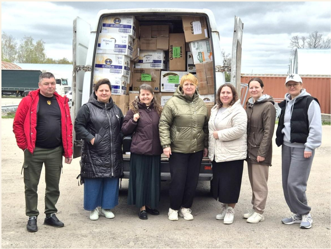
Generous Volunteer / OGT Milbank SD