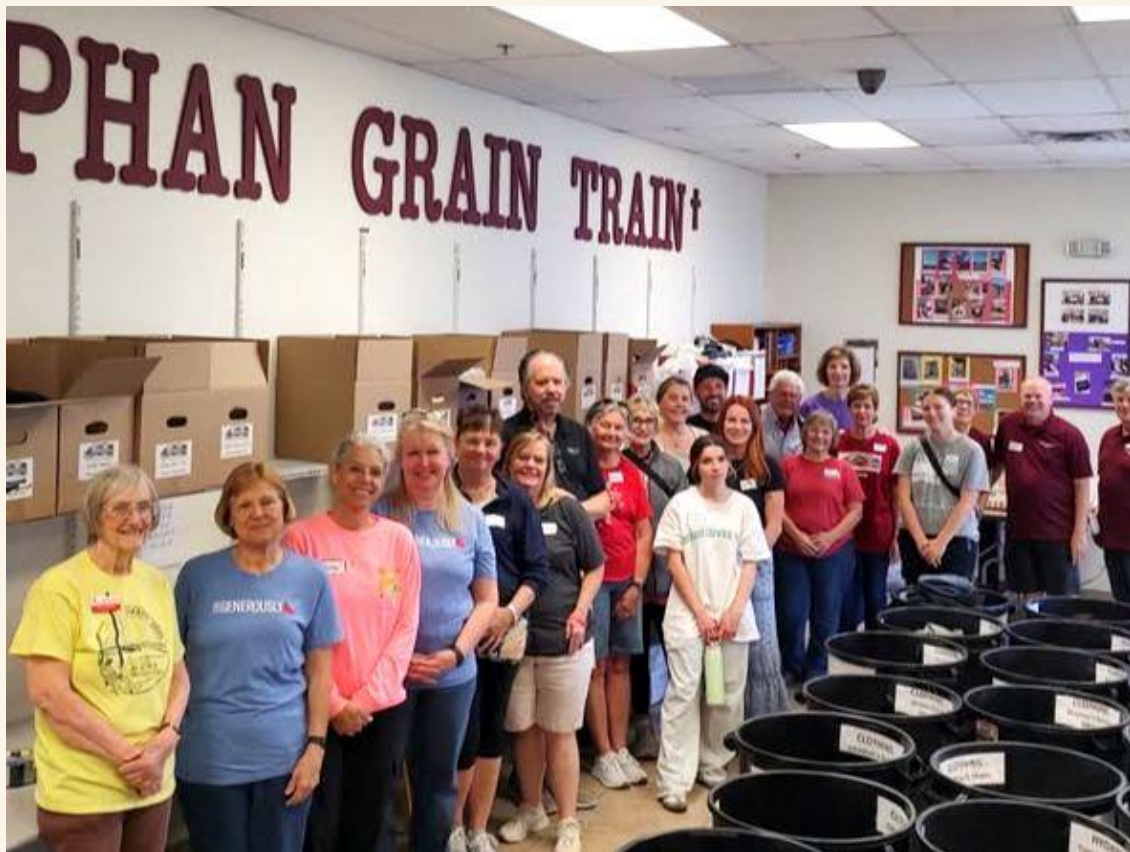
Desert Foothills Lutheran Church, located in Scottsdale, AZ designated February as Orphan Grain Train Month. The members