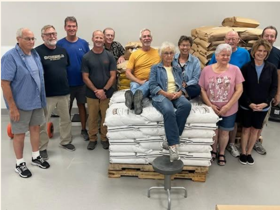
The original Orphan Grain Train Mercy Meals Automated Team are celebrating five years of packing meals with a staggering count of