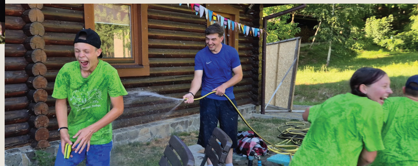
Children enjoyed water balloon games and water fights to fend off the 95-degree temperatures