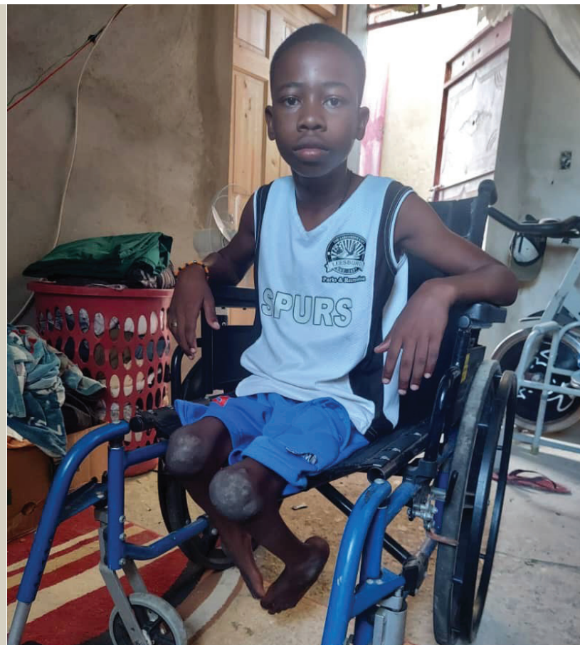
This boy received one of the wheelchairs that was included in the load to Haiti. Ten manual wheelchairs and six PET mobility carts were included in the shipment.