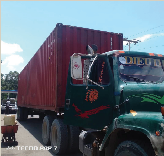
The truck carrying Wisconsin's container in Thomassique, Haiti boldly proclaims: DIEU DEVANT. Translated from French, "GOD IN FRONT" as it makes its way from the port of Cap Haitien to the recipient in Thomassique.