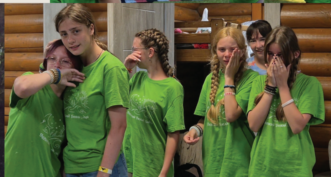
Teenage girls say "good bye" as they hug and cry. "At the end of the camp, every single child cried for two days. No one wanted to go home," wrote Alla.