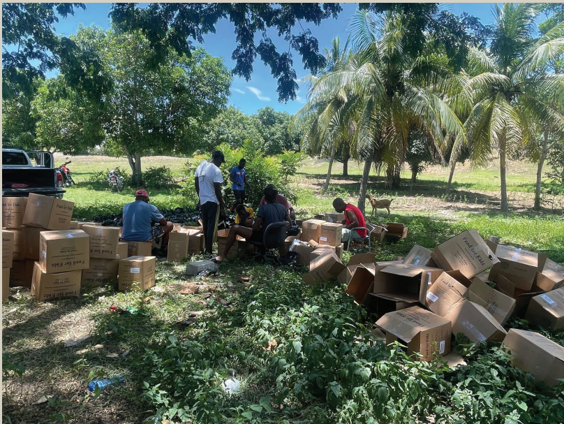
Two pallets of canned green beans and 142,560 Kidz Against Hunger meals along with blankets, clothing, school supplies and hygiene supplies are being divided for distribution to displaced individuals and families in Thomassique, Haiti.

The arrival of this shipment brought extra joy to the Wisconsin branch after Norfolk's #2154 sent in September of 2021 was forced to be abandoned at Port-au-Prince. After weeks of increasing fees at the port, it became clear that the "authorities" in charge had no intention of releasing the container without an exaggerated price tag. With the increasing political unrest and corruption, sending a shipment of much needed food and goods was too risky at that time. In that same year, Haiti's President Jovenel Moise was assassinated and the country remains with transitional leadership.