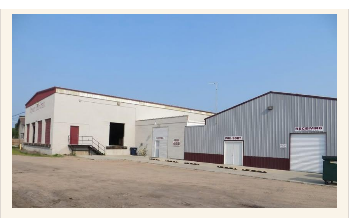
Warehouse of Orphan Grain Train Central Nebraska in Grand Island, Nebraska.

Orphan Grain Train Central Nebraska delivered items into the heart of Texas making deliveries at three locations: Grace at the donation station in Grapevine, Cove House in Copperas Cove and Cornerstone Children's Home in Quemado. All of these locations received much needed clothing, bedding, medical equipment, children's toys and bicycles. We are grateful to these organizations that are caring for the needs of others. Thank you, Central Nebraska volunteers for all you do to care for your neighbors.