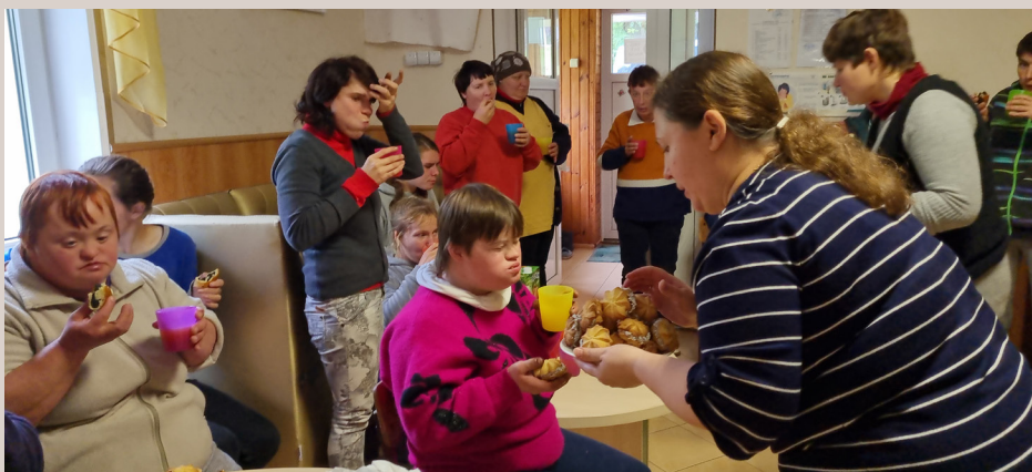
Pugachivka Mental Institution cares for many women with disabilities and is in need of hygiene and feminine supplies, blankets, and other needed supplies for daily activities at the center.