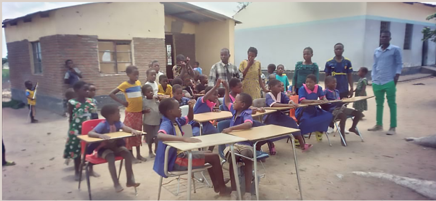
Two children give a 'high five' for desks to sit on! They are excited not to sit on the ground or logs for class time. When the schools were built 10 years ago there was no funding for furnishings. Thank you, OGT supporters for giving the children desks & school supplies!

Many people in this area struggle to find food for their family or other items considered basic to many of us. Many are suffering from starvation now because of very low yields from their gardens in all of 2024 due to severe drought or flooding. Those who have planted a garden again are putting their hope in the next crop but, today, as I write this, many in Malawi are facing challenges from Cyclone Chido that is raging through Mozambique and into Malawi right now. The rainy season that has just started brings with it ideal mosquito breeding conditions and therefore the danger of more malaria. Blankets provide a covering from the rain and the mosquitos and many are without this basic need. These people need the help of outsiders like OGT and Mercy Meals to survive. We are forever grateful that you cared enough to donate these items and pray you know what a blessing they will be.