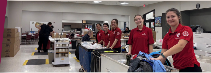
Servant Center sorting & packing room is busy with UNMC students in red and behind them is a group from Norfolk Public Schools. We are blessed to be able to accommodate more volunteers at the same time.