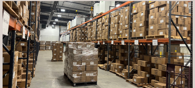
The new warehouse area is more efficient with storage along with easy access for loading shipping containers.