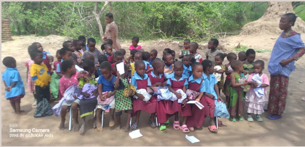
Some of the younger students received clothing along with small chairs for the class room. They are feeling loved with being showered with gifts they rarely receive.