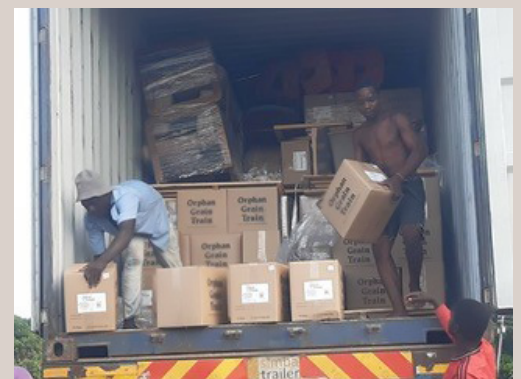
OGT's container filled with Mercy Meals and aid is unloaded for many in desperate need in Malawi.