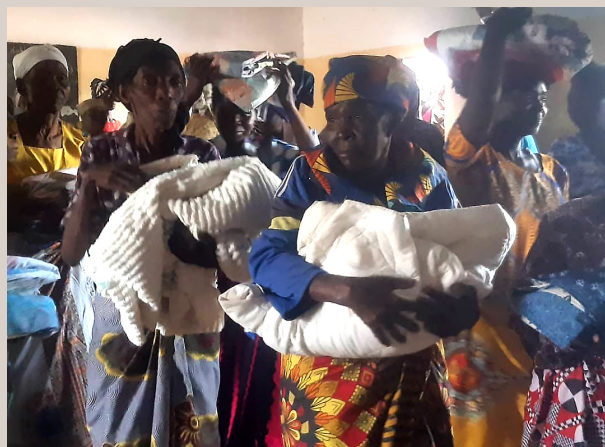
The elderly & widows were shown the love of Christ with blankets, clothing and other goods from OGT supporters. Mercy Meals were also shared to feed the families living in severe poverty.