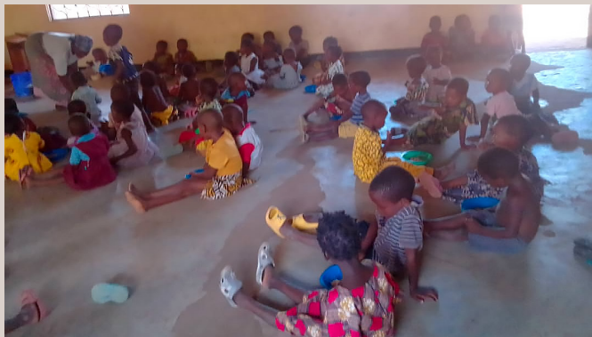
Lunch time is a lot better with Mercy Meals being served for a variety and nutrition. The children share meals and are grateful for full bellies.

The church does what it can to help those in need but many pastors lack a regular income themselves or have any way to provide for their family. Now, some of these men and women who are skilled in sewing will have the opportunity to start a small sewing business because they will be given a sewing machine donated by OGT. Ten small businesses will be started with these donated sewing machines. They will not only help leaders support their family but also help support the work of the church in these areas.