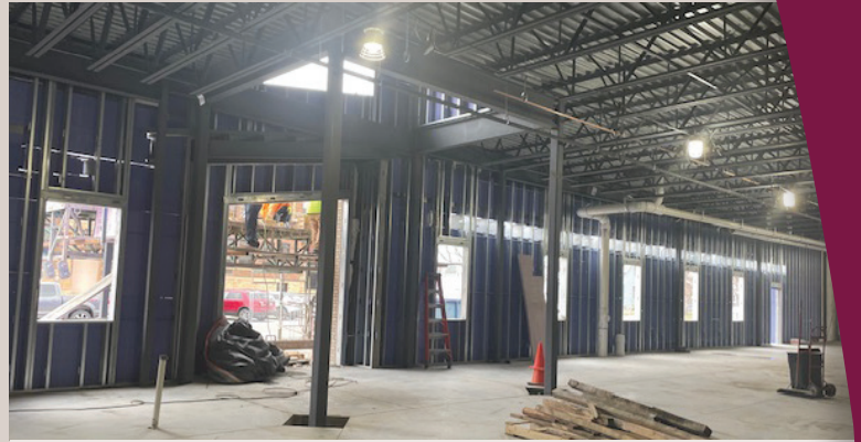
Donation drop off, sorting and packing room with laundry, small kitchen and offices will be placed in this area of the Servant Center. Ground level access will be a blessing when bringing in donations.