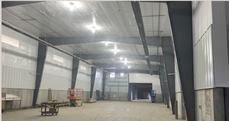
Multi-level racks will be placed along the sides and in the center to give maximum storage in the new warehouse portion of Servant Center

Since the ground breaking ceremony on September 14, 2023, construction has been expedited with good weather to be able to make plans for a Dedication Ceremony to be held Friday, September 13, 2024. Construction is planned to be finished this August. The new Servant Center will connect seamlessly to the Norfolk warehouse and also to Mercy Meals of Nebraska building for ease of moving pallets of aid and food. The 20,000 square feet addition will offer multi-level racks for maximum storage and provide effective flow of goods and efficient use of space. We would like to invite you to the Dedication Service and Ceremony as part of our convention this September. For more information see pages 4 & 5. We hope to see you in September!