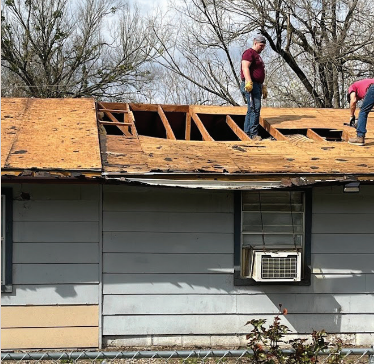
Not just shingles but plyboards and more to make this roof like new. What a learning opportunity for these players!