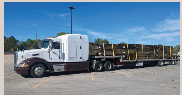
Two loads of 1,900 fence posts each were purchased by OGT to assist ranchers after wildfires engulfed their land.

If you would like to help with relief efforts please give toward domestic disasters and earmark it for Texas Fires. Please pray for these hard-working families struggling with so many losses.