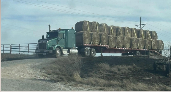
OGT has delivered eight loads of large bale hay to various ranchers devastated by the recent wildfires.

Orphan Grain Train immediately began looking for ways to help. We purchased several loads of hay which was trucked to different locations for ranchers to feed cattle. Also delivered was a load of small square