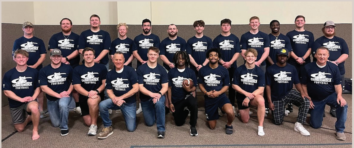
Concordia Nebraska football players with coaches and other mission workers take time to pose during their week-long Servant Event help two families in need. Thank you for your servant hearts.