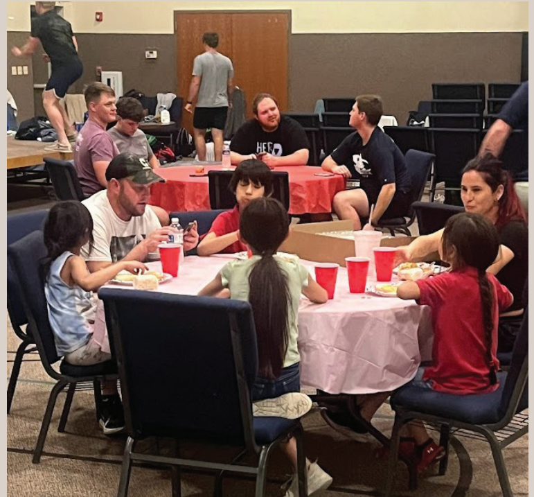
A single mom with her four children feel welcomed and blessed to join the players for dinner. The children loved learning about football and hearing stories of Jesus.