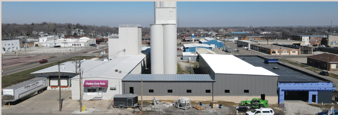
Walls are up and being finished with completion date in August. Make plans to join us for Dedication Ceremony on Friday, September 13.