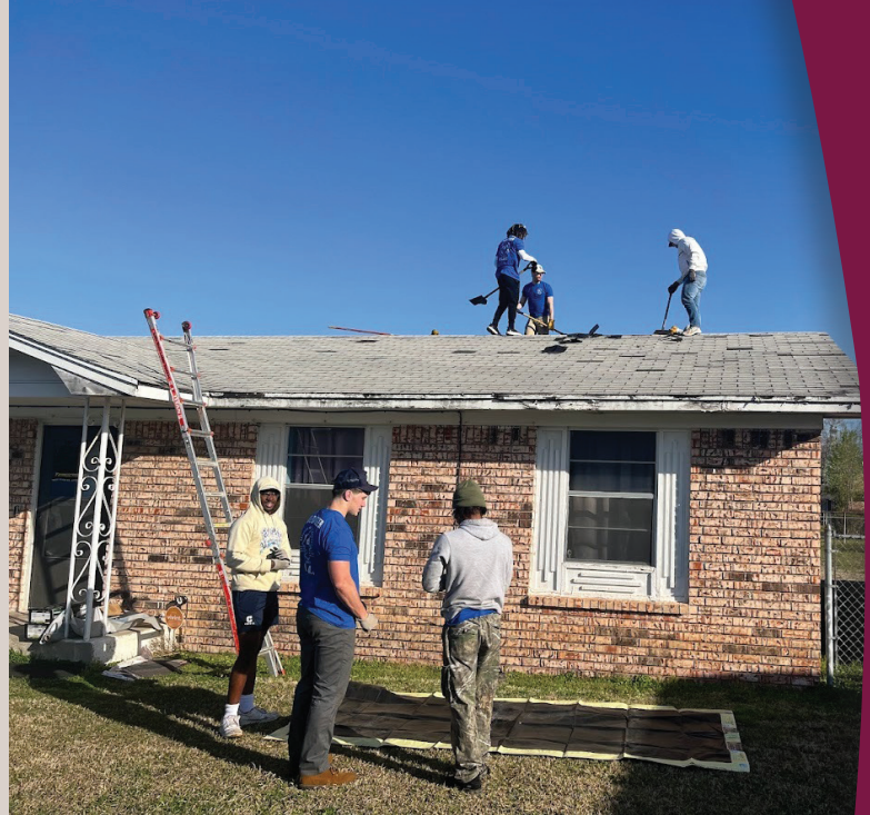
The Concordia Nebraska football players begin tearing off the roof of the second house that desperately needed repairs.

What an improvement the completed roof makes for this family and to know it will not leak!