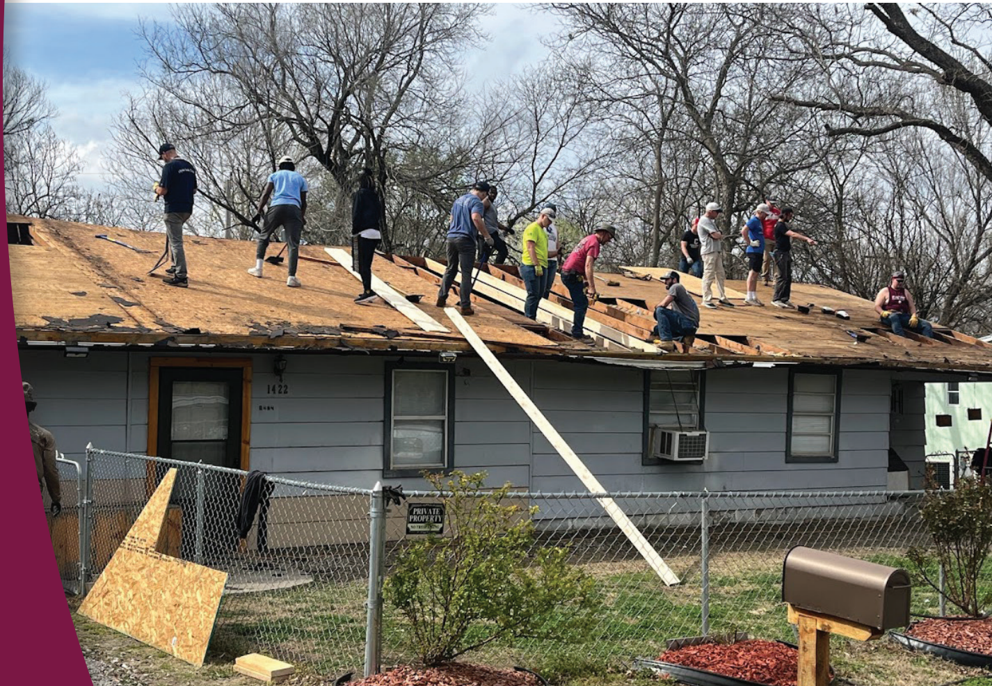
Spring Break – Concordia University Nebraska Football Players – One Week – Two New Roofs – OGT's First Mission Trip – Read more about this special event on pages 1-3.