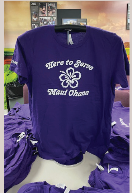
Thrivent had shirts made for volunteers of packing events and Giving Tuesday to wear to show support for families in Maui.

On Giving Tuesday, November 28, 2023, OGT was able to raise $109,000.00 with an additional $20,000.00 match from Thrivent to help purchase and ship food and aid to Maui. We are working closely with ELCS with the requested items for the families. As of mid-January, there were still 264 people living in hotels in hopes of receiving temporary housing soon. With housing, their needs will change to home furnishings and bedding. At the end of January, OGT's Norfolk warehouse in Nebraska loaded a 40 ft. container filled with Mercy Meals, eight pallets of 5-pound bags of rice, diapers, other hygiene items along with several boxes of purple Maui shirts from Thrivent. These shirts were used for Mercy Meal packing events and Giving Tuesday acknowledging serving Maui families.