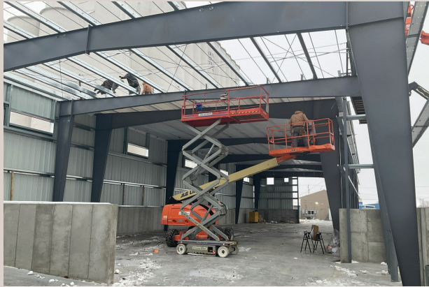
Construction began on the Servant Center that will connect to the Norfolk warehouse in Nebraska. The larger sorting/packing room will help to accommodate larger groups for volunteering.

The new Servant Center was a vision for many years and is now a reality with walls and support beams put in place. The center will connect seamlessly to the Norfolk warehouse allowing ample parking for volunteers and those dropping off donated items. The 20,000 square foot addition will offer multi-level racks for maximum storage and provide effective flow of goods and efficient use of space. Breaking ground started in June of 2023 and soon after the structural beams were put in place and walls were attached. The grain bins even got a face lift with fresh paint. There is a lot of building yet to build but we are hoping to be completed in August of 2024.