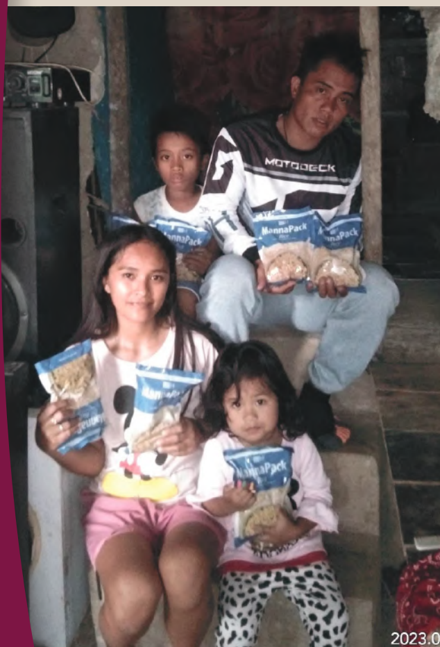
The Ganeda family struggles with having enough food to eat with no steady work. They felt blessed to receive fortified rice meals for nourishment and fill their bellies.