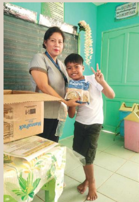
Teachers at 45 schools handed out Manna Pack meals for the children to take home! So many blessings for these families in need.