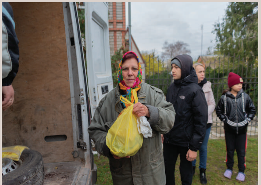
Families wait in line for food and hygiene products while enduring very uncertain times.

to give hope and to show the love of Jesus to devastated families. Romania, Moldova, Latvia and Lithuania recipients have also received several containers to help with the thousands of refugees seeking shelter in those countries. Items shipped included beds with mattresses for shelters and churches, triage medical supplies for the wounded, blankets, winter clothes and boots, hygiene kits, diapers, and generators. Included was also a large tent that is being heated and used to house many families seeking refuge. We have shipped pallets of canned vegetables and meats, water, fortified rice meals, and dry products which are greatly appreciated with feeding hundreds of families at shelters and to make care packages for those remaining in their homes. In some regions, there are no jobs, grocery stores have empty shelves and limited electricity and running water. OGT's recipient, Smolin Ministries, have volunteers courageously going into regions recently de-occupied by Russian soldiers to give care packages to the families that have been hiding in their homes during the shelling. The families are so grateful for food, hygiene items and to see friendly faces of fellow Ukrainians. Orphan Grain Train also had 5,2910 pounds of bread flour and 66 gallons of sunflower oil delivered to For God's