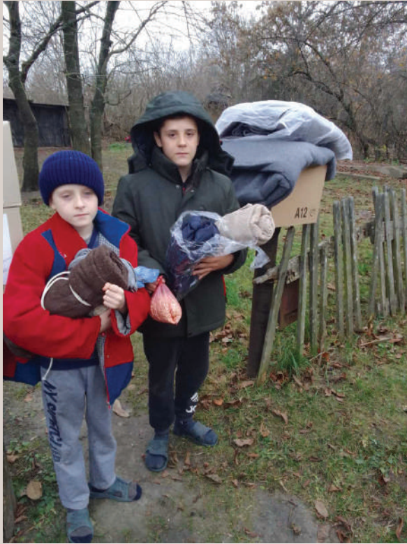
These Ukrainian boys received hygiene kits and blankets..

Children International (FGCI) in Ukraine. The much-needed flour and oil were delivered to several locations which baked fresh bread to feed many families in need.