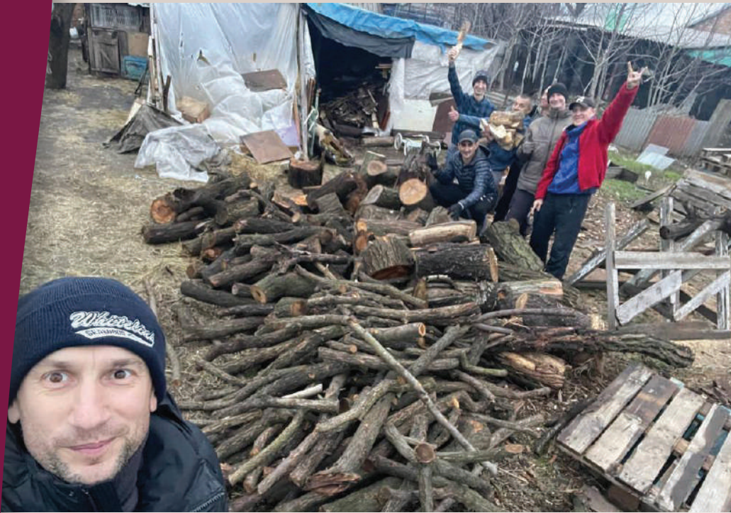
Some very happy and relieved families in eastern Ukraine were able to get firewood to heat their homes. Thank you, OGT supporters!

Orphan Grain Train has had eight air-cargo shipments and three shipping containers of aid and food distributed in Ukraine