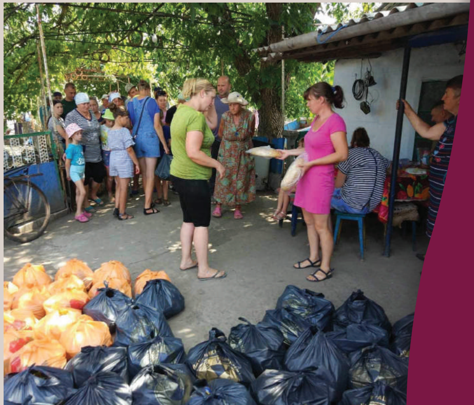
The fresh baked bread along with other supplies are shared with families in desperate need.