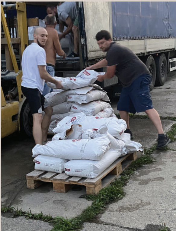
OGT was able to have more than 5,200 lbs. of bread flour and 66 gallons of cooking oil delivered and distributed to several destinations to make bread for those in need.

OGT's Wisconsin branch shipped three of the shipments to Ukraine. Many other OGT branches shipped humanitarian aid to our partners in countries serving Ukrainian refugees. Yet, other OGT locations have delivered aid to the Norfolk warehouse for shipment and others have worked with local organizations shipping to Ukraine. Thank you, OGT volunteers for your continued commitment to serving Ukrainian families.