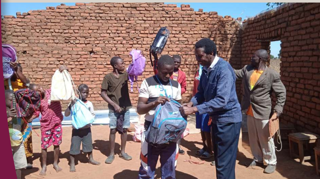
Children receive school kits with their own supplies for school. These backpacks truly encourage and give pride to the children to attend school.