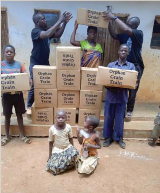
Families receive Mercy Meals to feed their children during desperate times of hunger. Thanks be to God!