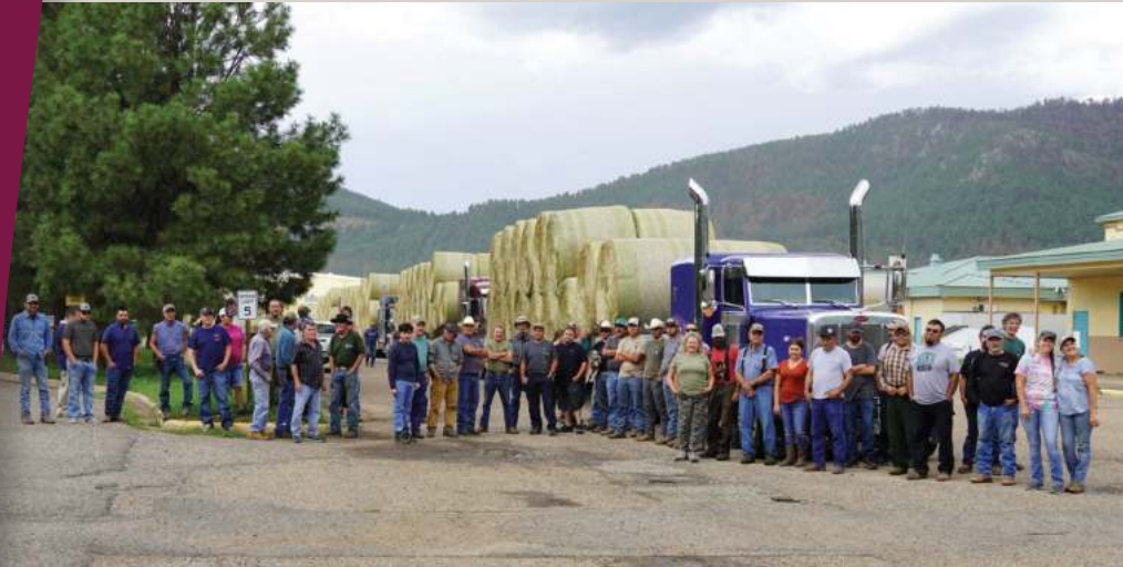
Ranchers are relieved to receive much-needed hay from OGT's five truck-loads. They are smaller ranchers and are grateful to be able to feed their hungry cattle.

The Hermits Peak / Calf Canyon Fires entered the County of Mora wreaking havoc on small farming and ranching community. The fire burned homes, barns, summer pastures, and hay fields