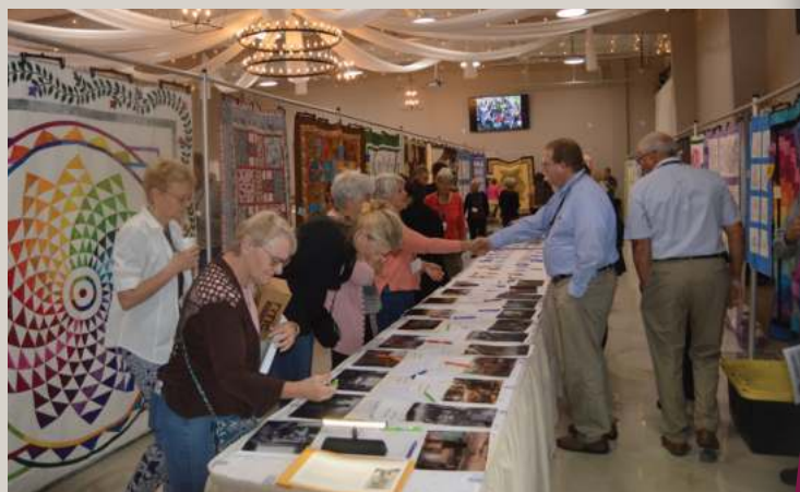
Many attendees checking out the beautiful quilts and Ukraine photos to be auctioned off. More than $10,000 was raised for Ukrainian relief efforts from the auction.