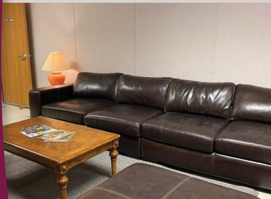
Very nice donated furniture fills the recreation room where families can relax and visit. The units are beginning to look cozy and comfortable for the families arrival.

The families have shared liking Nebraska, and how it reminds them of the geography of Ukraine. They like the small-town living. They love attending worship, social gatherings, cooking and sharing of meals with each other and with newly made friends. They are settling in and ready to welcome more Ukrainian families to the community.