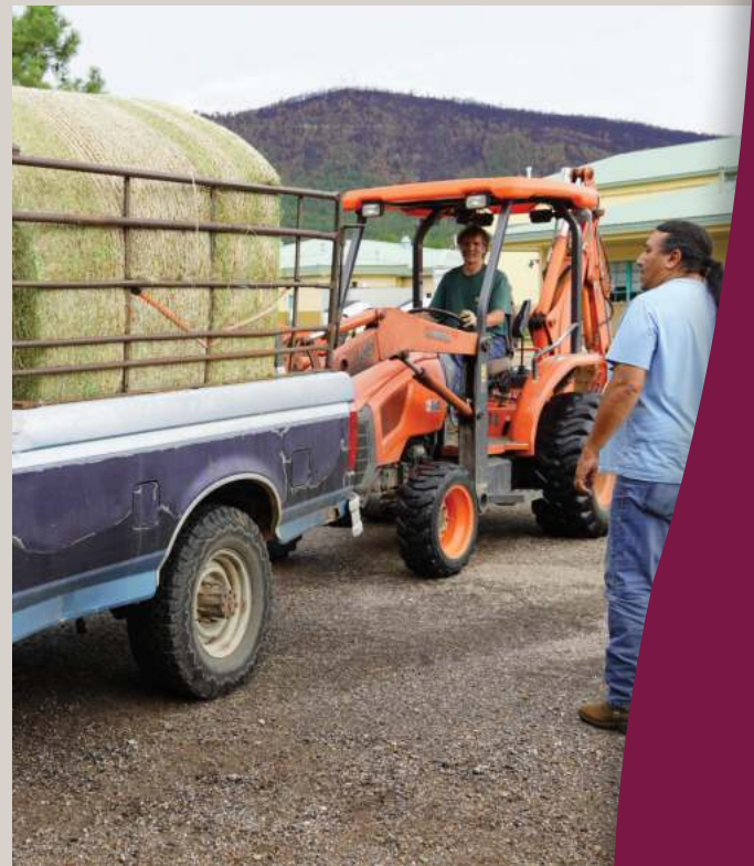
A grateful rancher receives a bale of hay to feed his cattle and able to keep the ranch in the family.