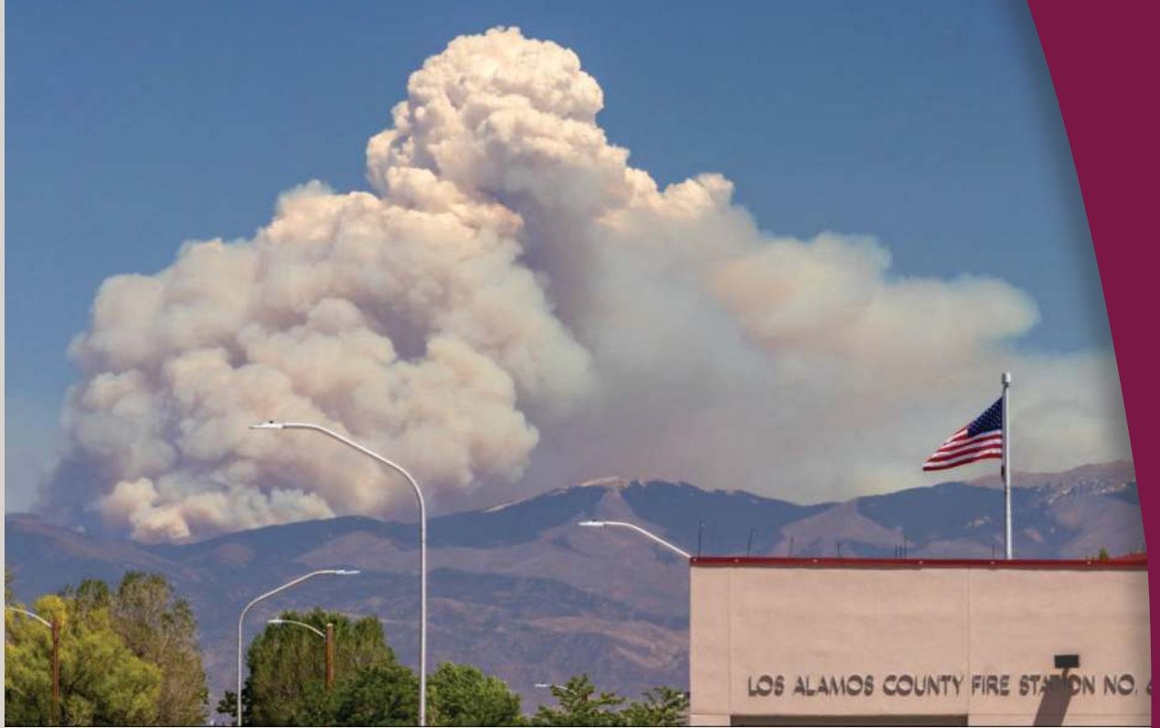
The enormous towering smoke is from Calf Canyon/Hermits Peak Fire; the largest and most destructive wildfire in recorded history in New Mexico.

Thank you OGT donors and supporters, we could not have made these purchases and deliveries if it wasn't for your support.