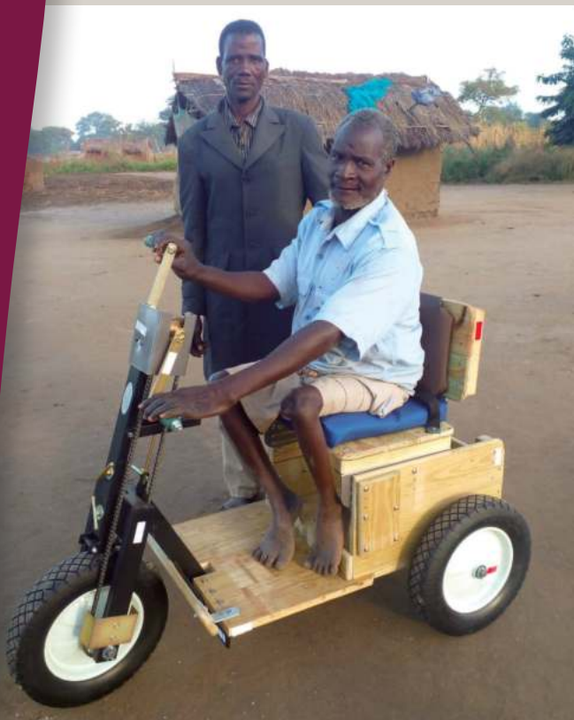
This disabled man is rejoicing with the freedom of movement from receiving a mobility cart from OGT. No more crawling on the ground.