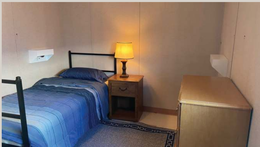
A boy's room is getting ready to welcome Ukrainian families to the portable units.

The children are attending school which is going very well academically and gaining new friends. All of the families are progressing along with the immigration process and continued paperwork required under United for Ukraine.