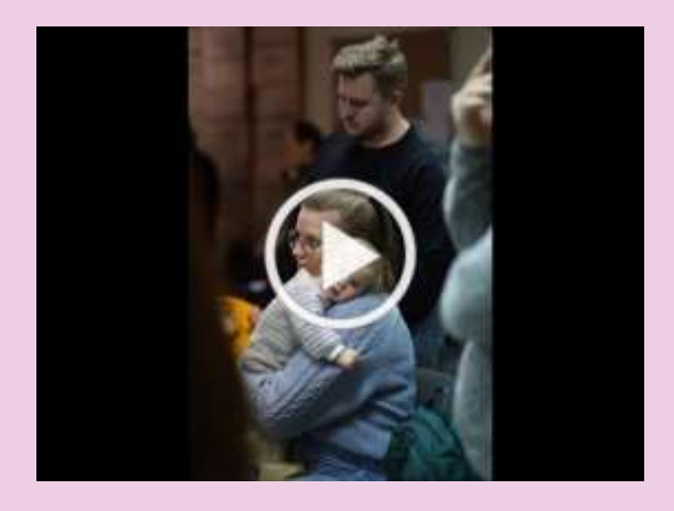
The photos and the very touching video are from our recipient Charitable Fund Light of Reformation that is giving aid to families still in the Ukraine.