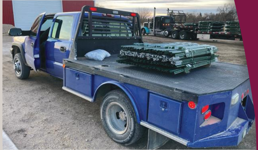
A rancher is grateful to load fence posts for his cattle. Notice the truck load in the back to help many other ranchers desperate for help after wildfires.

A truckload of steel fencing posts were delivered to the Paradise area and distributed to 30 ranchers and farmers. Each rancher received a pallet of 200 t-posts.