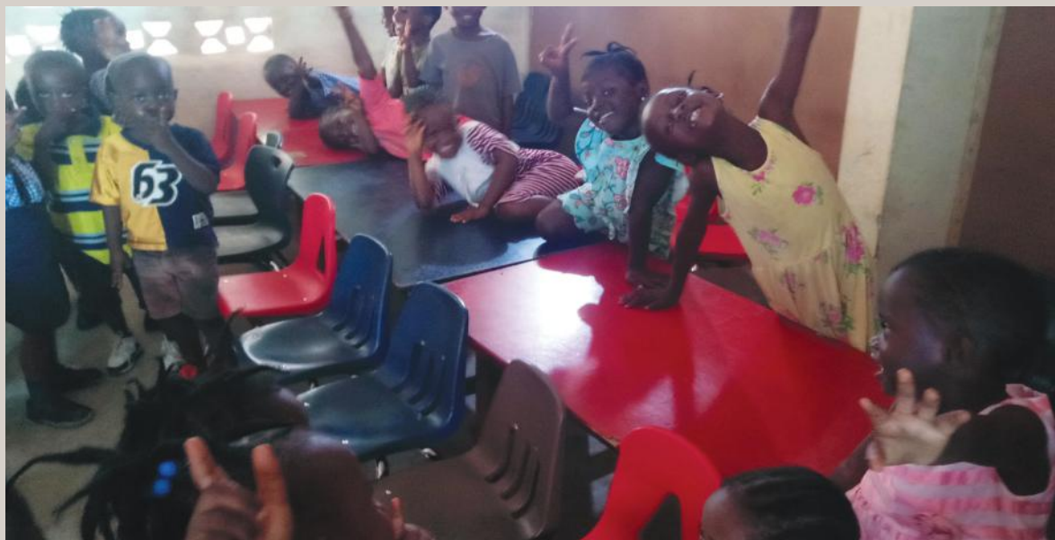
The joy and pride can be seen on their faces for the tables and chairs from OGT's Wisconsin Branch.

widows, visually impaired, physically challenged, the destitute and sick. Many of these groups are forgotten and barely have the money to take care of basic or medical needs. CRS