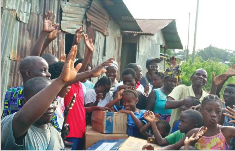
The visually impaired and orphans raise their hands in praise to our Lord for Kids Against Hunger meals and other goods from Orphan Grain Train.