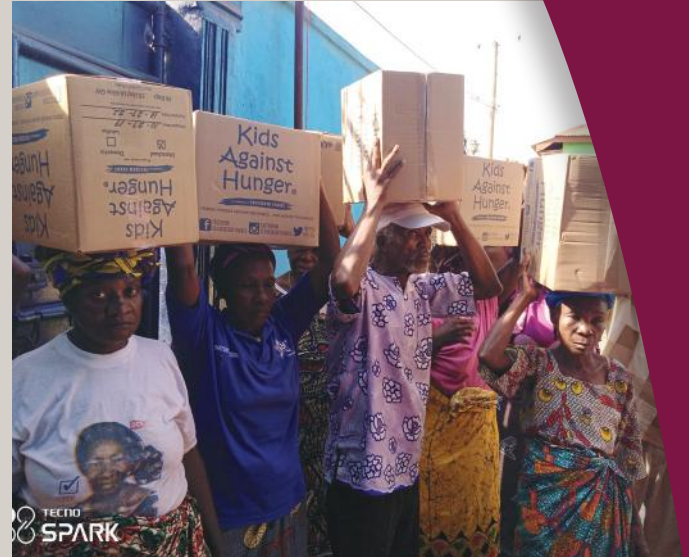
Food from OGT is shared with the widows and elderly living in poverty with limited income.