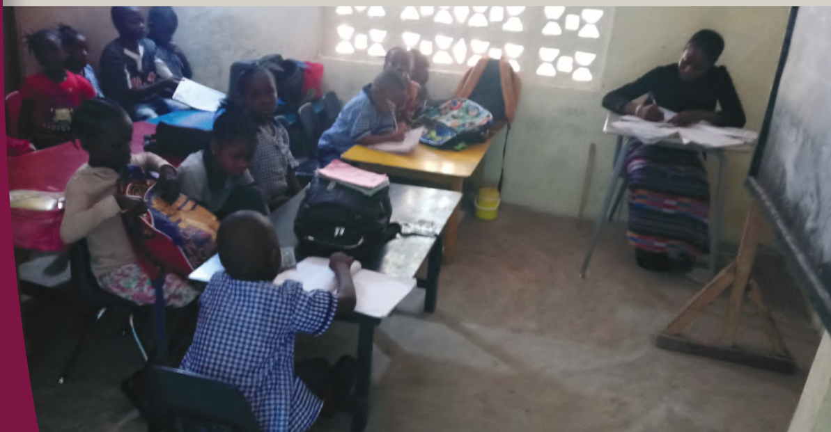
The students are grateful for backpacks full of school supplies and to know that people care about them.

set up feeding programs along with Bible study. They distribute meals to many churches that encourage learning about Christ then take food home with a Bible to share with family. Many return, hungry to hear more Scripture.