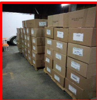
STAGING & LOADING TRAILER

CANNED FOOD DIAPERS NEW SOCKS HYGIENE SUPPLIES