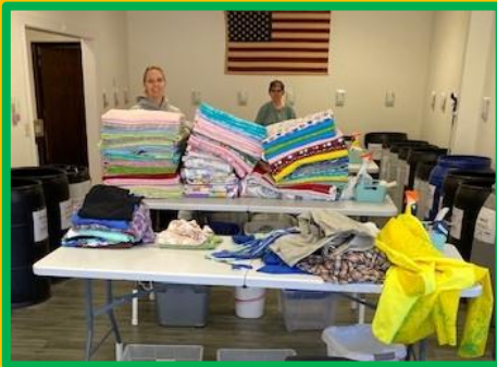
143 BOXES OF BLANKETS

In response to this request from our home office, the Wichita OGT Branch loaded a small box trailer and pick-up truck with 258 boxes of donations received from our friends in the Wichita area. The goods were then driven to Norfolk on March 15 th to meet the deadline for the air cargo delivery to Poland. We want to thank all those who responded so quickly and generously to this cause with goods and monetary donations (over $3700) and to the workers who helped us box and load the trailer.