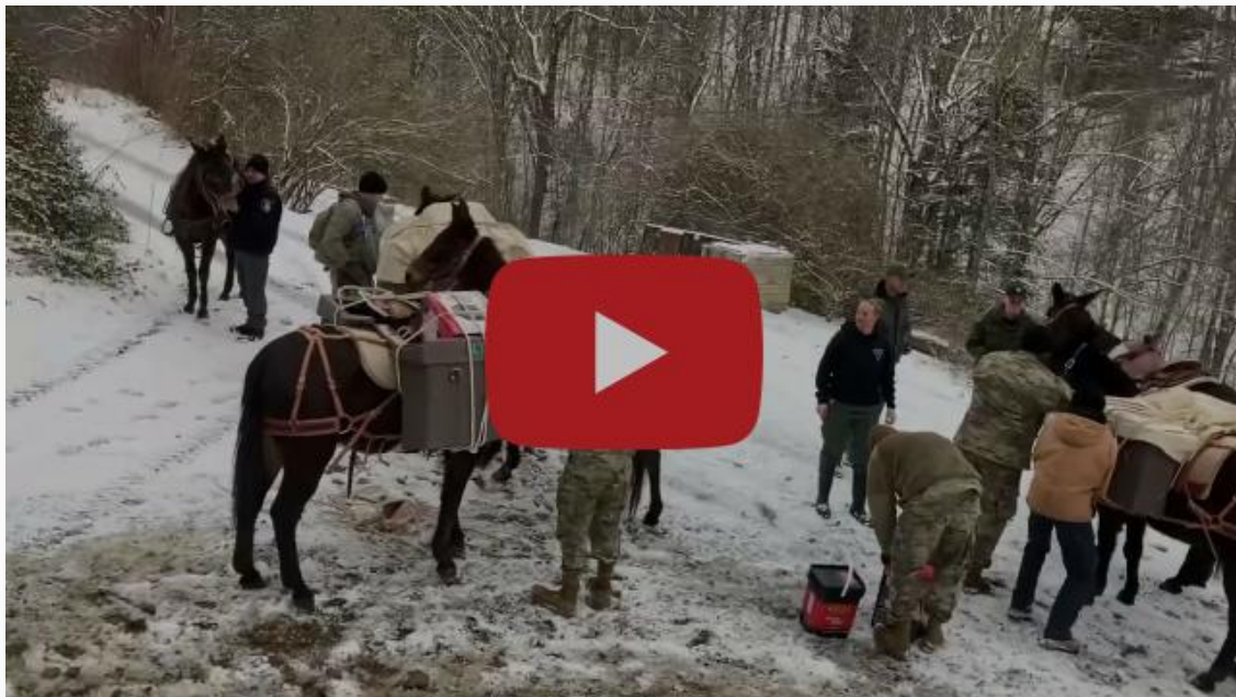
Mission Mules Relief Work in West Virginia following the hurricane flooding.

We will highlight the other supported relief efforts in subsequent issues of the OGT News Relay.