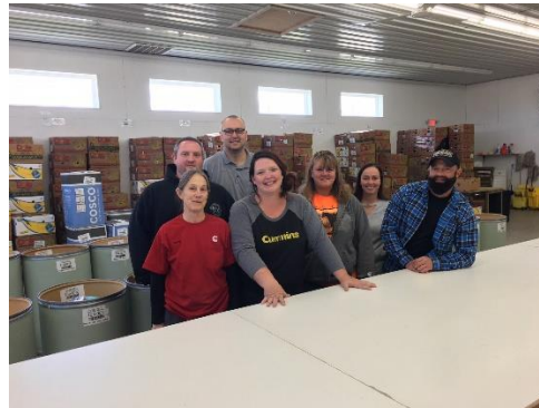
A group from the Walesboro Cummins block line