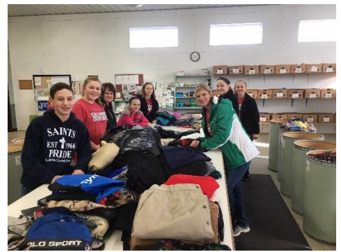
Lutheran Central Jr Honor Society