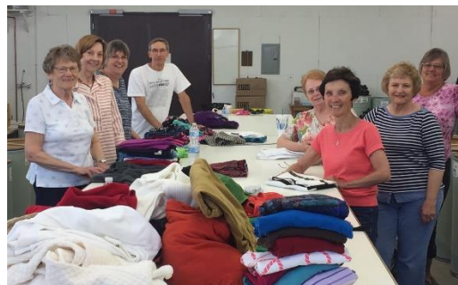
Zion Lutheran, Seymour

And a special thank you to the folks who helped load the 53' trailer for Cornerstone Children's Ranch, Quemado, TX. It was a hectic day and the manager didn't get a picture to share but know that you are