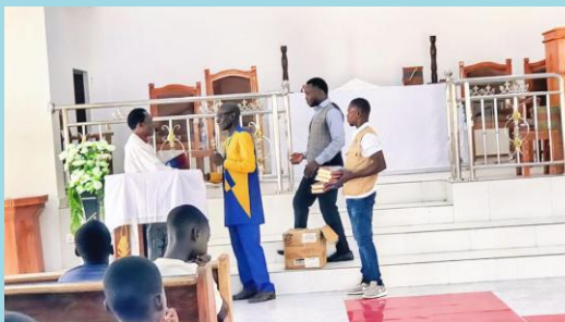
Church service in Ghana

Ebenezer Akwanga Human Rights and Humanitarian Institute (EAHRHI).