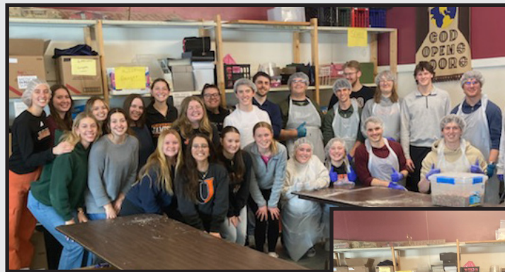
30 UJ students packed 8,220 Meals in 2 hours