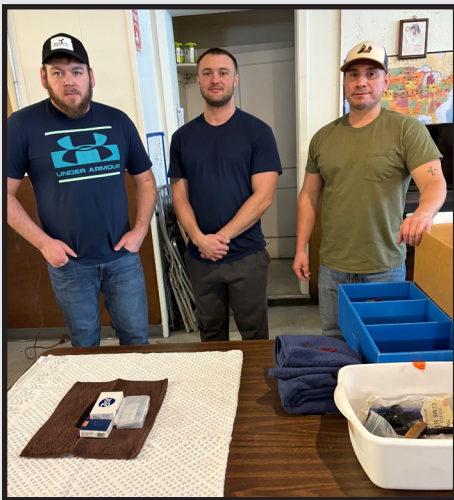
Group from JRMU assisted with 101 hygiene kits