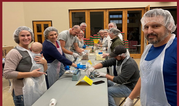
Temple Baptist church packed over 7,000 Mercy Meals this fall.