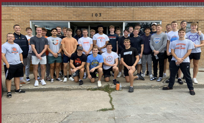
The University of Jamestown Men's Basketball packed over 9,500 Mercy Meals in September.