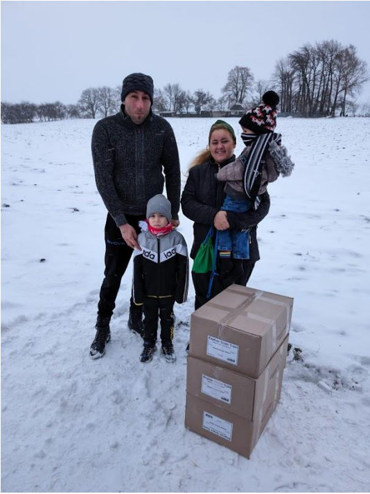
Items for the Young and Old alike.