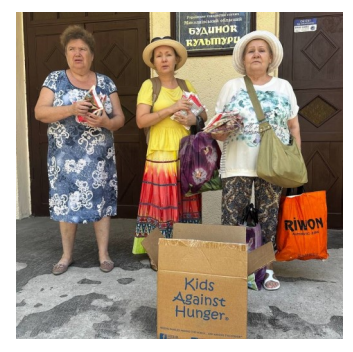
Women in Ukraine proudly display much needed gifts of food and medical equipment

Thanks from Malawi" page 1.) Our Ukraine container arrived only two months after leaving on June 26<sup>th</sup>, and pictures of grateful recipients just started coming in. We are told Smolin Ministries will convert the container we gave them into either a bedroom unit or a storage facility.