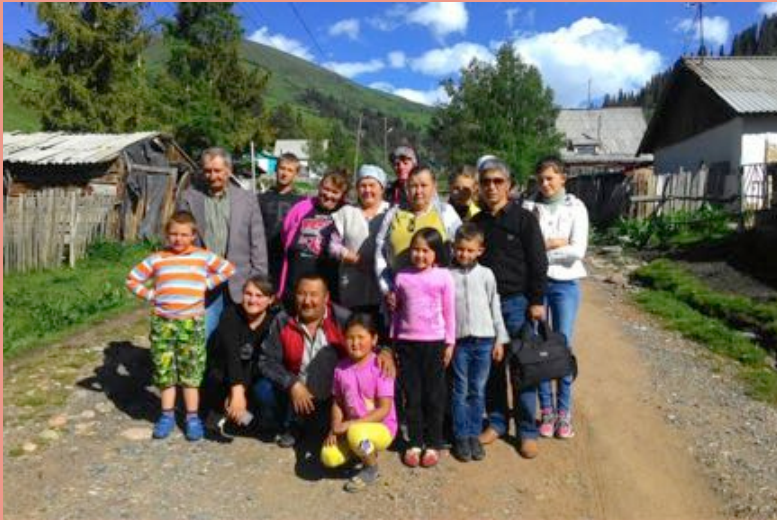
This is what the village of Shakhty looks like today.

The Public Fund “Health & Education of the Youth in the 21 st century” works in the Talas oblast of Kyrgyzstan. About 700 needy people receive aid from this Fund. From the OGT 1625 the Fund received 50 boxes of children’s, men’s and women’s clothing, 5 boxes of women’s shoes and 2 boxes of accessories.