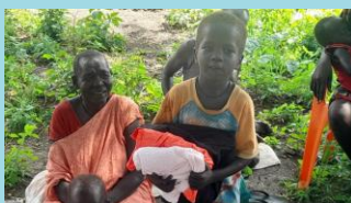
This little boy (an orphan) with his grandma at Malek Leper Colony