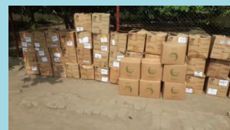
Some donated items for 336 prisoners, Bor Main Prison