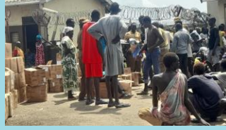
Prisoners receive the donated items