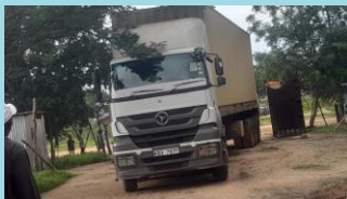
The arrival of the container at the MGC, July 27 July, 2024

"Despite heavy rains in our area, since the arrival of the container on 27 July 2024 at the MGC we have been busy counting and distributing the donated items. So far, we have given out some items to 278 pastors, 256 needy people at Malek Leper Colony, and 336 prisoners, among others. The distribution is still ongoing. Below are some of the pictures we have taken".