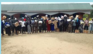
Pastors ready to depart MGC after receiving their donated items