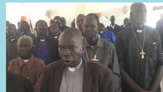
Pastors sharing the gospel and praying in the MGC Hall before the distribution of items