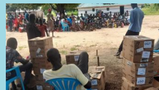
Distribution of OGT donated items at Malek Leper colony