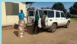
MGC delivers the donated items by its car to Bor Main Prison