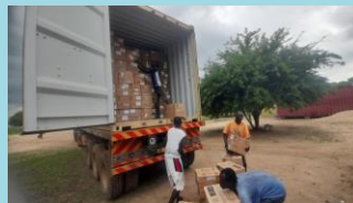
The unloading of the donated items before putting down the container