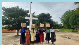
Some women pastors at the MGC Monument after the distribution of items