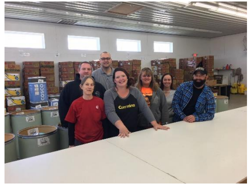
A group from the Walesboro Cummins block line