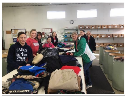
Lutheran Central Jr Honor Society