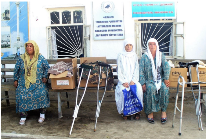
Tajik women display a bounty of clothes and crutches