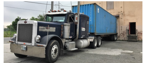
Tajikistan container at the OGT MAB warehouse loading dock

Shipments are determined by specific requests from our destination partners. Here are the latest updates.