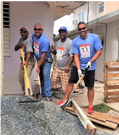
Puerto Rico volunteers get to work with shovels and rakes from OGT MAB

With so many in need, what did Orphan Grain Train do? Our branch raised funds and collected donated cleaning supplies to help fill a 40' container to Puerto Rico. It shipped through a joint effort of the Mid-Atlantic, New England, and Maryland branches and got through port customs in San Juan to anxiously waiting victims of hurricane Maria in late December. Recipients (front page photos) eagerly accepted gifts of clothing, food, shovels and rakes. Centro Cristiano Gracia Y Verdad Inc. (The Christian Center of Grace and Truth) reported to us, "What a great Christmas gift for those in Puerto Rico