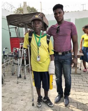
A therapist helps a Haitian man select crutches

them over to the clothes station... with some crutches and canes. Then they went to the prayer station and received a Bible and the ladies prayed over each person. Keep up the good work for the Lord!" ■