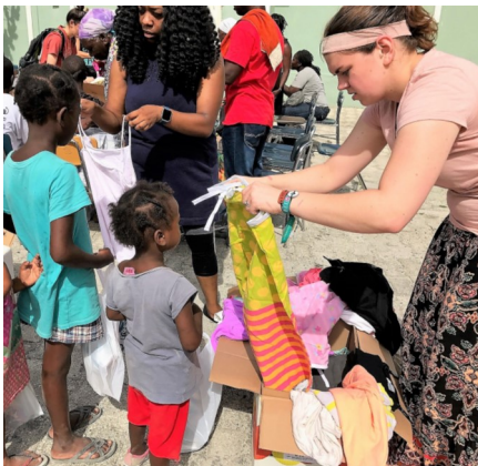
Haiti girls receive pillowcase dresses from St Timothy Lutheran Church in Crystal River, FL

Corporately, OGT has so far sent two semi-loads of groceries to a Lutheran church pantry in Spring, TX; seven loads of sheetrock, two loads of wall insulation, a truck load of shingles, and three loads of supplies also went to a Houston Lutheran church to help flood victims. Additionally, a 40' tool storage-container and two sleeping units were sent for Houston's volunteer village. A semi-load of tools and construction materials was sent each to Corpus Christi, TX, and Fort Meyers, FL. Meanwhile, residents of Puerto Rico continue to suffer as 45% of the electrical grid is still out making ordinary daily tasks arduous. OGT has shipped five containers of much needed food, water, supplies and clothing there, and will send more. As in the case of Hurricane Katrina, OGT is committed to helping those in need for the long run.