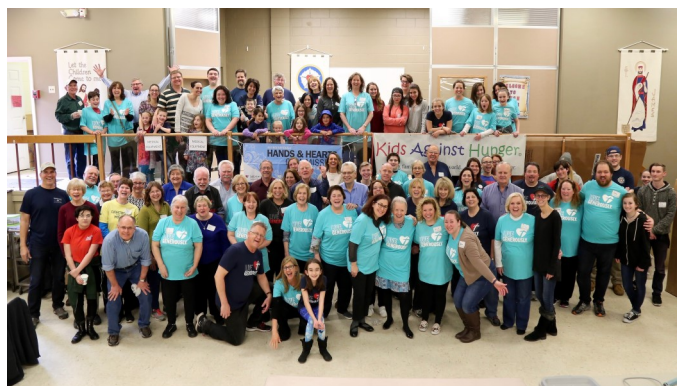
Generous members of St. James KAH team.

over 150 people came out to show their love for others in need. Children, teens, and seniors packed over 23,000 meals! In addition to the food, St. James sent us medical equipment, bicycles, diapers and new underwear. Their generosity didn't stop there; the congregation included a check to help support OGT's Russian Orphanage 'Warm Boots' program. Thank you, St. James, for hosting such a wonderful event to help those in need—twice! ■