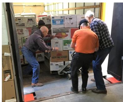
Loading goods for Puerto Rico.

Our upcoming shipping schedule has been revised. May 18 th plans to load a container for Haiti were cancelled