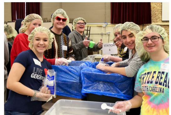
Teens enjoy meal-packing at St. James.