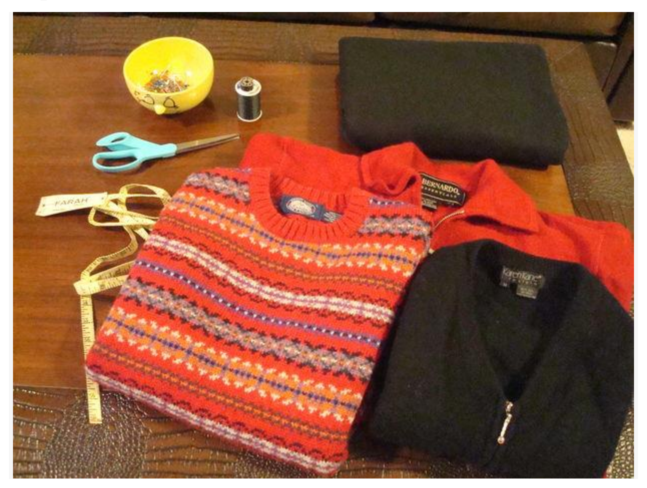
Step 1: Materials Needed