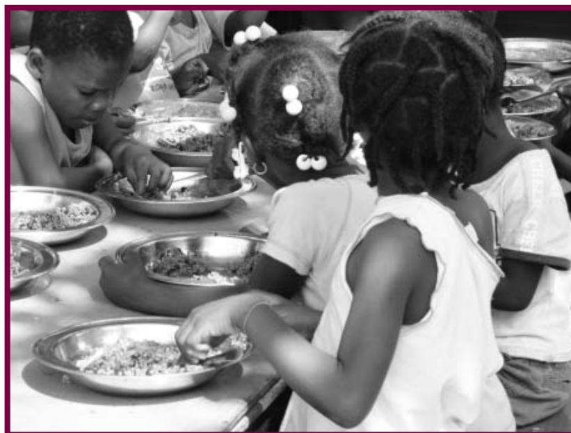
Haitian children enjoy a meal provided by Orphan Grain Train.

this arrangement, Orphan Grain Train had a secure, fenced compound with a warehouse, an established system of distribution,