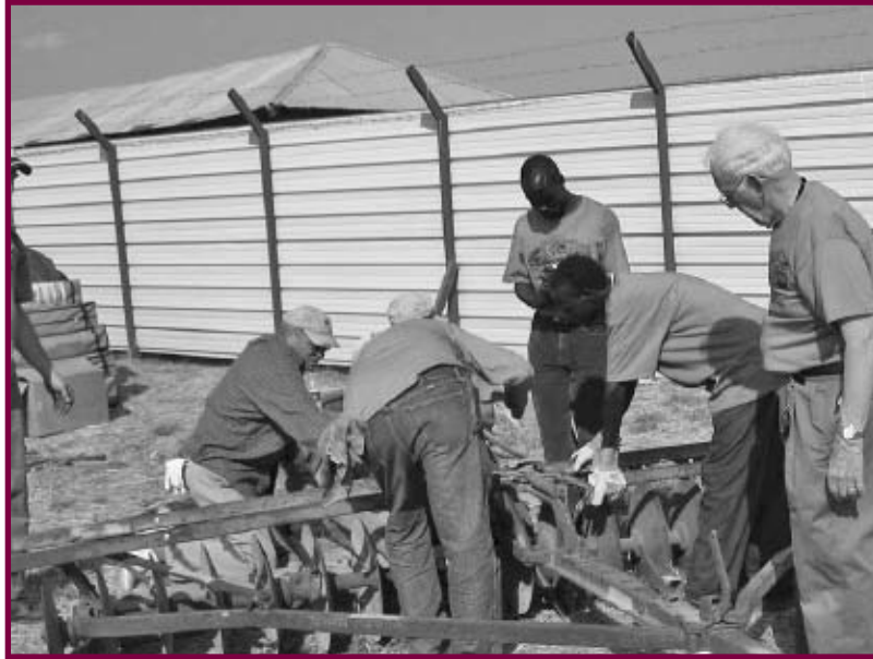
Volunteers and Church Members Reassemble Farm Machinery

There is a great need to share the love of Jesus Christ with the largely Muslim population, and having a