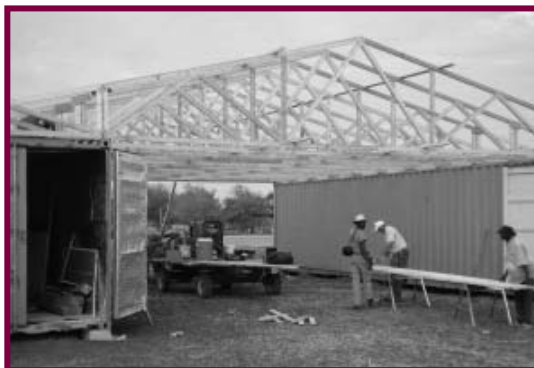
Setting Rafters on the Containers

the containers to a secure location, which allowed them to store and assemble the equipment in relative safety. Members of the Lutheran church in Malakal gathered to help the team, and the Sudanese were able to learn new skills using the new tools by working alongside the American team.