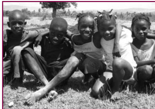
Haitian earthquake survivors helped by Orphan Grain Train.