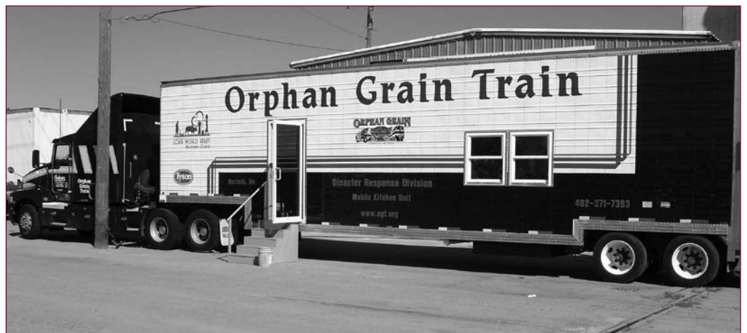
This 45-foot-long mobile kitchen was built by Orphan Grain Train and taken to New Orleans last September. It is used to prepare three meals a day for hundreds of volunteers at Camp Restore and Bethlehem Camp.

Orphan Grain Train's name and character are explained by the words of Christ recorded in the Gospel of John chapter 14, verse 18: "I will not leave you as orphans; I will come to you." †