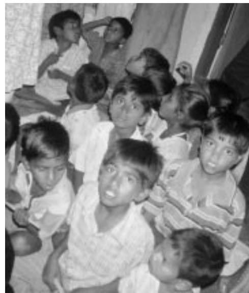
Orphan children waiting for clothing distribution.