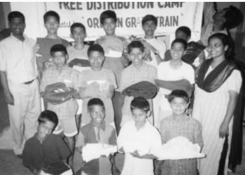
Children at an orphanage in India hold the clothing they received from Orphan Grain Train Indiana.

3 School supplies—Sorted by Indiana children in seven Lutheran schools to be given to children in Christian day schools in India. With volume buying, identical materials were sorted for each child. Thus, 1,500 sets of school supplies were donated for the children in India. New Testaments and Bible coloring books were also in each box. St. Peter's Lutheran of Columbus and other churches in the area paid for the shipping, which totaled $4,200. Thrivent Financial for Lutherans also helped with the effort.