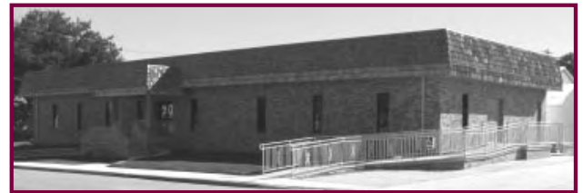
Orphan Grain Train's Norfolk, Neb., office building was built through special gifts given for the "Building on Living Stones" capital campaign. The campaign was completed on December 31, 2008, and the building is debt-free.

From Orphan Grain Train, Inc. Audited Financial Statements for the Year Ended May 31, 2008.