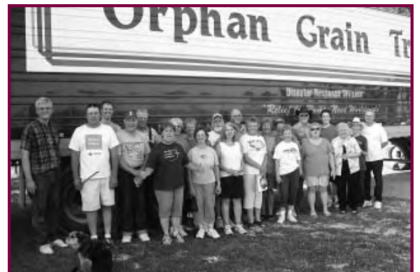
Laborers for Christ volunteers came to Herington, Kansas, on a Sunday afternoon from a nearby construction project to help load the Orphan Grain Train semi-trailer (June 2008).