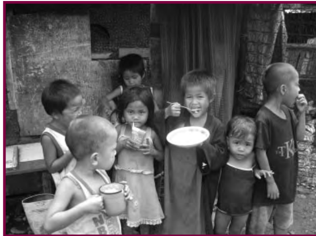
Children who live at the “Smokey Mountain” garbage dump in Manila, Philippines, enjoy Kids Against Hunger meals. Their normal diet had been boiled food scraps from restaurants.

Each “Kids Against Hunger™” food package provides six nutritious meals.