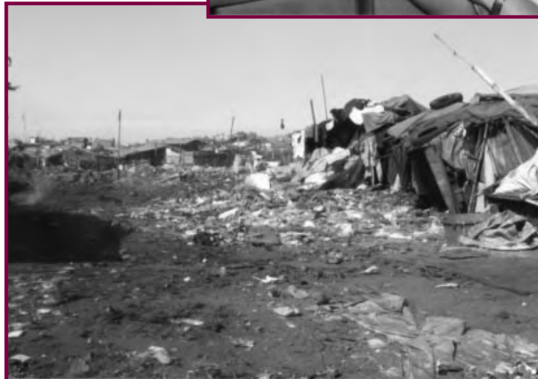
Smokey Mountain garbage dump in Manila is named for the haze of methane and other gases hovering over its mountain of garbage. A Catholic daycare provides “Kids Against Hunger” meals there, thanks to the combined efforts of Kids Against Hunger and Orphan Grain Train.