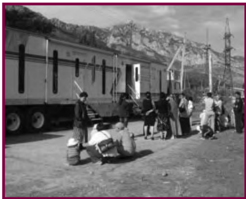
This mobile medical clinic serves several villages in Kyrgyzstan. Ten years ago Orphan Grain Train shipped the clinic and its semi-tractor to Kyrgyzstan.

Every Thursday is Humanitarian Day at the office and people from approved groups come with taxis, trucks, and cars and receive your boxes of love. Thank you again from those who benefit from all your hard work.