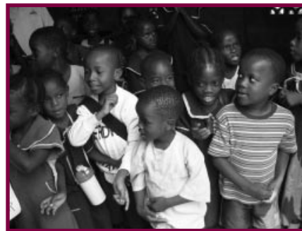
Children at Harold Gessner Lutheran School during a break from class.