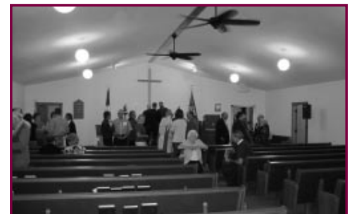
Members and guests visit after dedication.