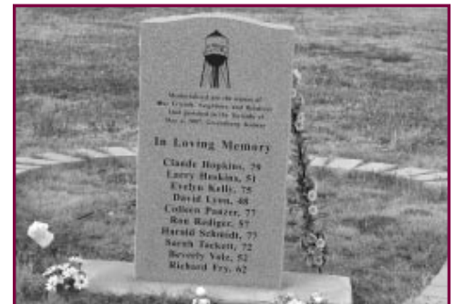
Nearby monument to the Greensburg residents who lost their lives in the May 4, 2007, tornado.