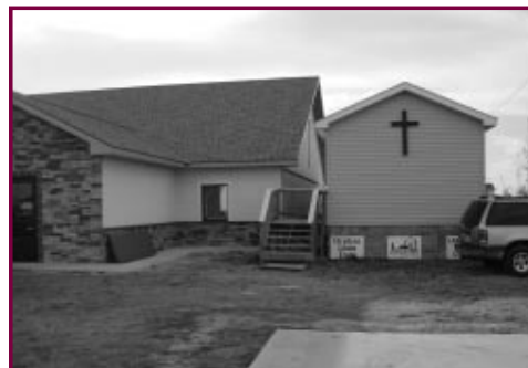
Two other Greensburg congregations also used this modular structure as their temporary worship centers.