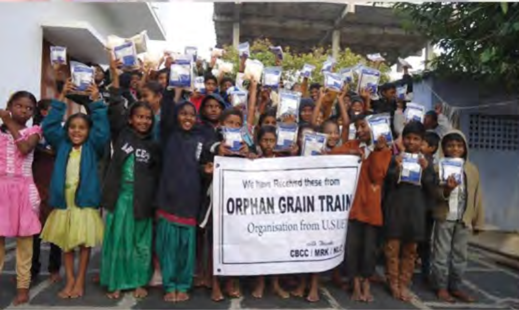
These Children say "Thank You" from the projects of India.