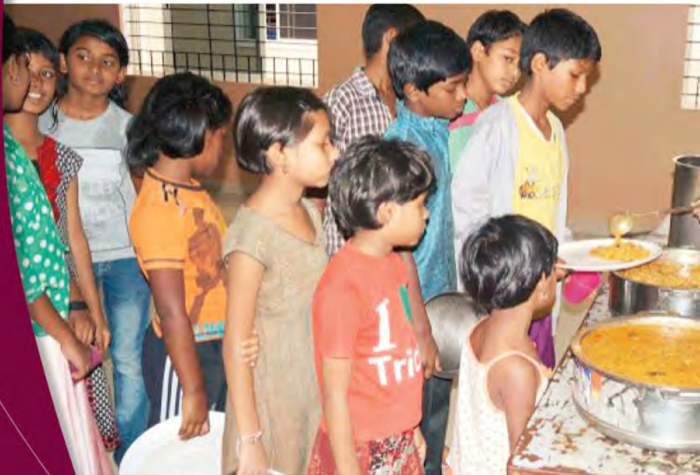
Children at an orphanage in India are in line for donated fortified rice meal donated by OGT. Read more about their story on page 3.