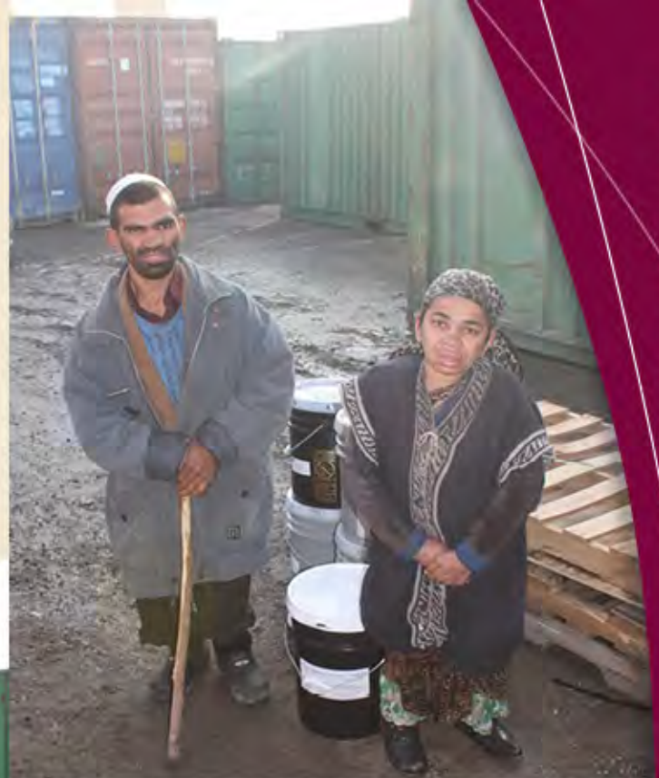
With economic uncertainties, families are grateful for the help from OGT.

Last November, Norfolk warehouse shipped a container that arrived in Tajikistan. If you are wondering, "Where is Tajikistan?" It is a Central Asian country bordering Afghanistan, China, Kyrgyzstan and Uzbekistan. Our new recipient in Dushanbe, Tajikistan was able to unload 26,856 Kids Against Hunger meals, corn, wheat, diapers, toys, walkers, toilet risers, wheelchairs, bedside table, and first aid kits all in one day and distribute 90% of it. The people were so happy and grateful for the food and supplies. The other 10% of the shipment will ship to Pamir to help families affected by an earthquake last December.