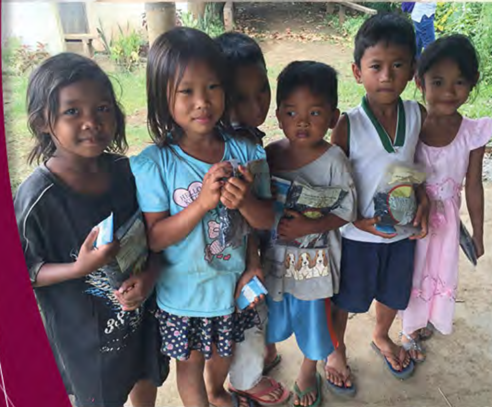
These precious children hold soap and a bag of beans donated by OGT.