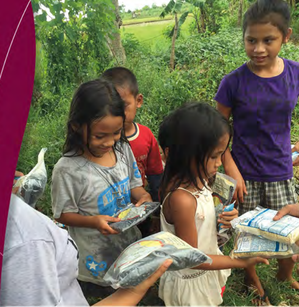
Look at the beautiful smile looking at beans for food.