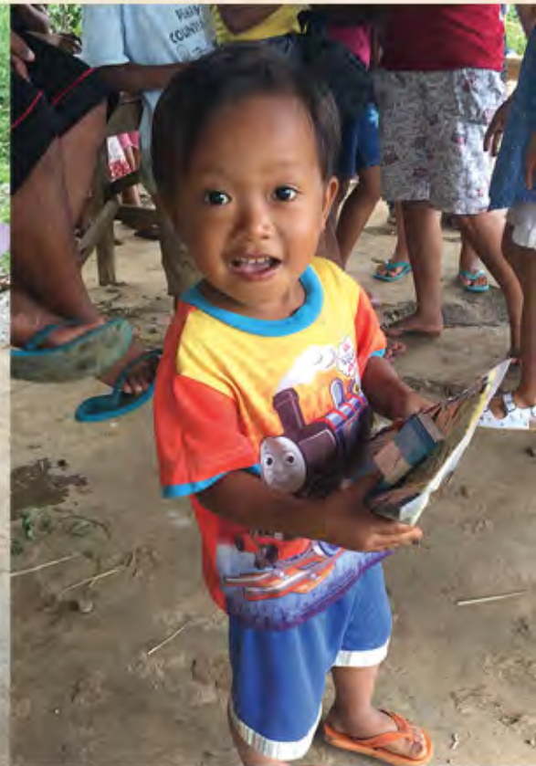
His expression says more than just "Thank you".