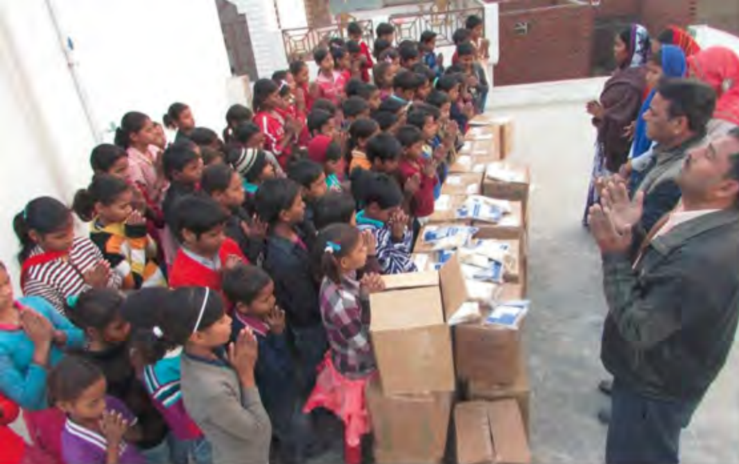
Thanks be to God for the delivery of Mercy Meals to feed the children.