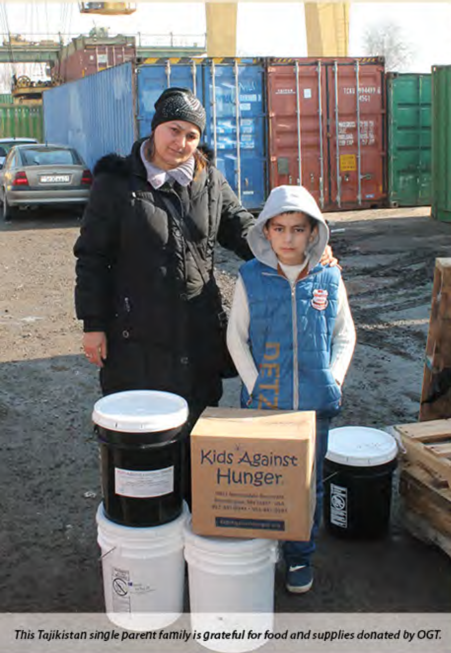
This Tajikistan single parent family is grateful for food and supplies donated by OGT.