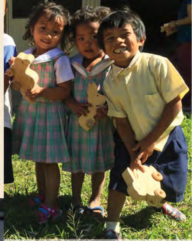
These special handcrafted animals bring such joy and hope to these orphaned children.