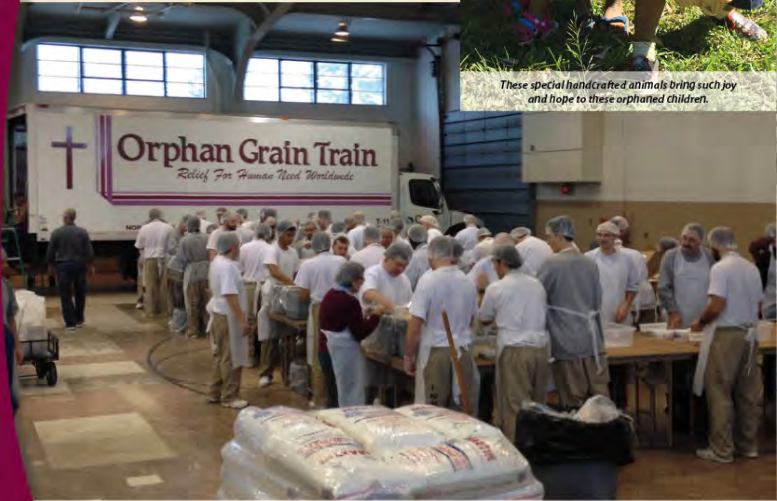
Inmates do God's handy work by helping to feed the hungry.

Orphan Grain Train and Mercy Meals of Yankton recently hosted a meal-packing event at Mike Durfee State Prison in Springfield, South Dakota. More than 200 men participated and packed 60,000 meals! Orphan Grain Train placed the meals in inventory and they will ship to either Haiti or the Philippines for feeding children and families in poverty. What a wonderful service these men are doing for so many families and children in need – Thank you!